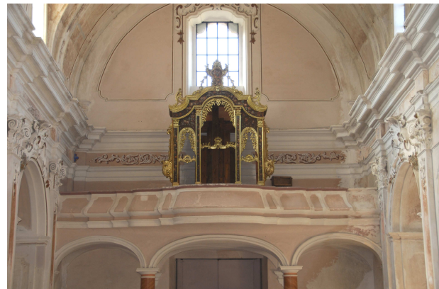
The choir and the old organ (which doesn't work any more) consisting of a small number of pipes supplied with compressed air from bellows.