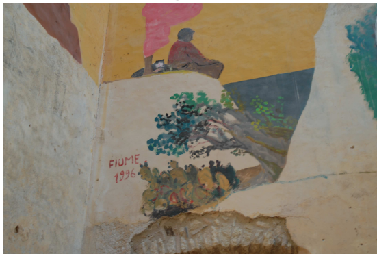
Fiumefreddo Bruzio, 1996 Rooms of the castle. A painting by Fiume. The painting depicts maestro Fiume while is sitting on a small knoll, silent and pensive.

blue sea, from where you can admire and enjoy, far on the horizon, the Aeolian Islands, among which Stromboli stands majestically. In the 90’s, the town Council of Fiumefreddo Bruzio conferred the freedom of the city on Maestro Salvatore Fiume.